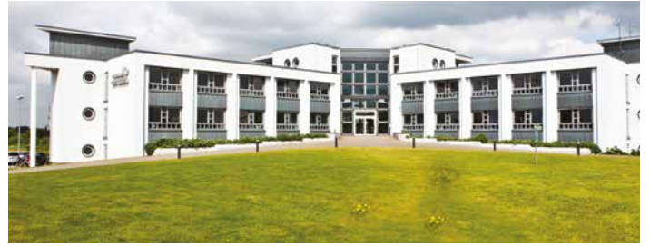
Aerodata headquarters in Braunschweig, Germany

The straightforward integration of PRO.FILE with the company’s MiCLAS ERP system via the BizTalk Server was also a major factor in the decision, along with its strengths regarding the integration with ProE, AutoCAD, and Engineering Base.