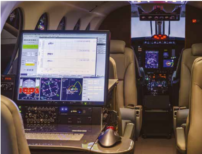
Flight inspection systems by Aerodata