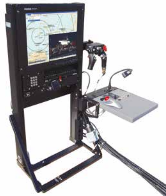
Helicopter workstation by Aerodata

Via configuration, PRO.FILE gives its users utmost flexibility in the design of interfaces, forms, lists, and reports. It allows Aerodata to map the complex approval workflows that are mandatory for all aviation manufacturers. What also worked in favor of PRO.FILE were its straightforward integration with the company's MiCLAS ERP system via the BizTalk Server and its strengths regarding the integration with ProE, AutoCAD, and Engineering Base.