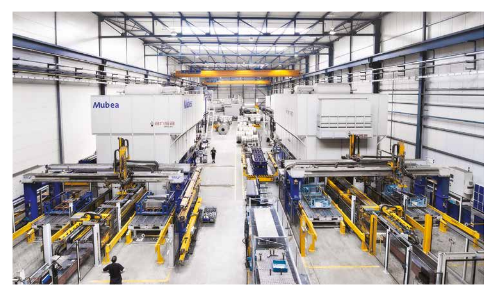
Assembly line for tailor rolled products