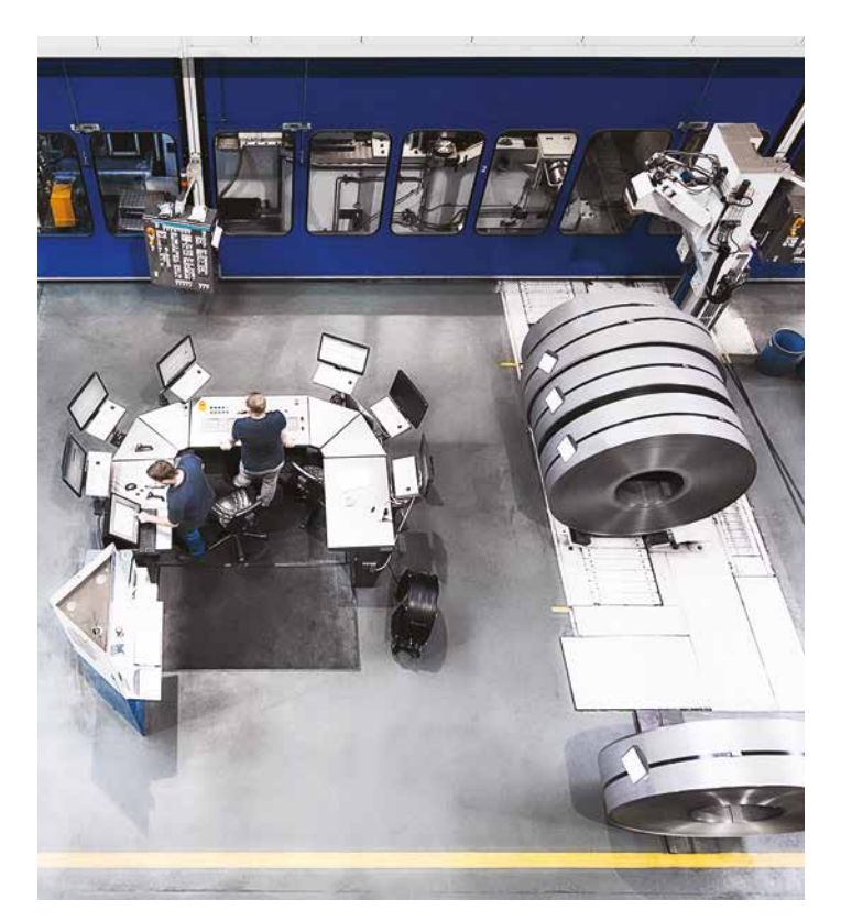
Production control center for the cold-rolling mill

The key to achieving optimum results with PLM is the ease with which PRO.FILE can be customized to meet the requirements of Mubea. Marc Gajewski, who masterminded the project, put it this way: "We want to adapt the system to our processes and we want to be able to do so ourselves – allowing us to respond to changes quickly and without having to rely on the PLM vendor. That is why we asked three of our employees to complete PROCAD's administrator training course at the company's headquarters. Immediately after their return, they began to incorporate our processes and user interfaces in PRO.FILE. This was very straightforward. With PRO.FILE, we were able to rely on our in-house expertise (rather than outside help) to quickly achieve the results that we thought impossible with our previous solution, even though we had been using it for a much longer period of time."